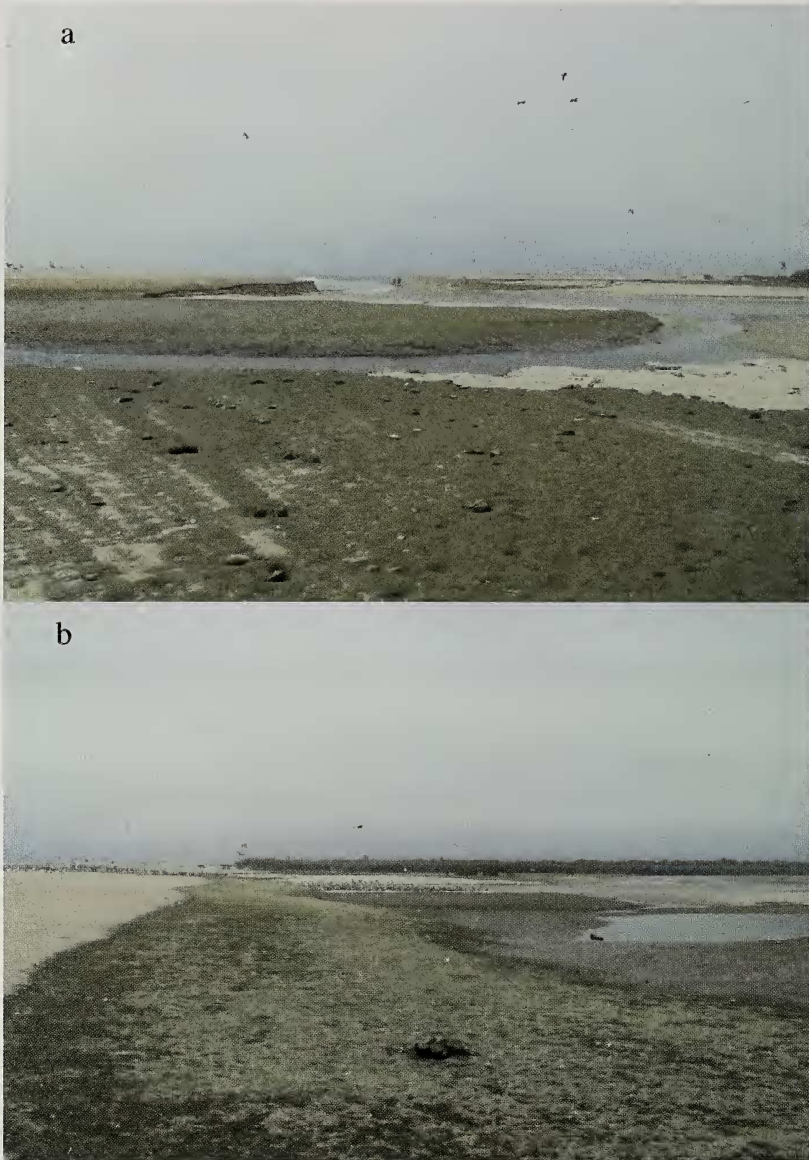
Fig. 3. a) View of lower Santa Clara River lagoon on the morning of observations, 17 September 2010, illustrating the shallow, formerly submerged sand flats with two men standing in the breach in the barrier sand berm for scale. Photo by C. Dellith. b) South side of drained Santa Clara River lagoon with small isolated ponds and seepage from the sand into the remnant watered area. Photo by Chris Dellith, 17 September 2010.

(about 275 l/sec or 9.7 cfs) from the north ran southwest joining the river channel about 150 m upstream of the breach. Less flow emanated from a residual channel ( \leq 15 l/sec or \leq 0.5 cfs) from the south side of the lower lagoon to near the breach (Fig. 3b, background). The low tide was 0.148 m (+0.37 ft) at 01:06 and high tide was only 1.24 m (4.1 ft) at 07:51 the morning of the breach and low again at 0.82 m (2.7 ft) at 12:51. The lagoon was